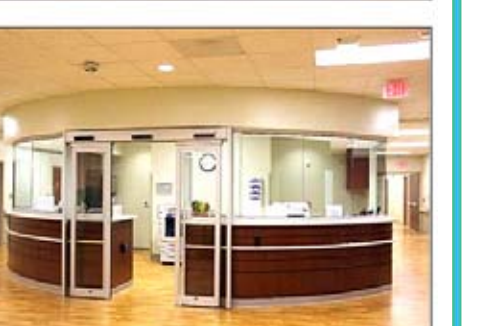
Assurance Health Systems inpatient hospitals are specifically designed to provide a safe, comfortable atmosphere for the effective treatment of seniors